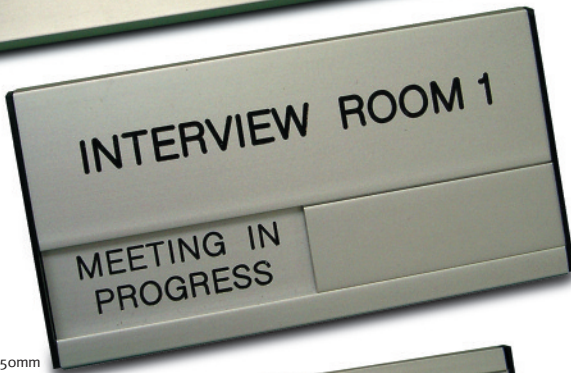
SL4 80 x 150mm