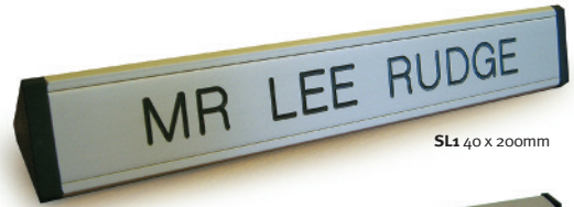
SL1 40 x 200mm