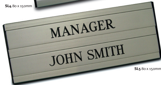
SL5 80 x 150mm