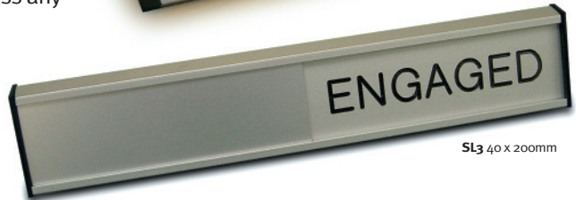
SL3 40 x 200mm